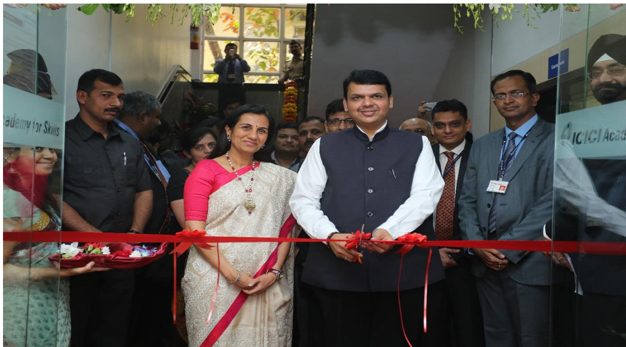
Inauguration of ICICI Academy for Skills, Mumbai by Shri Devendra Fadnavis, Hon'ble Chief Minister of Maharashtra in the presence of Mrs Chanda Kochhar, Managing Director & CEO, ICICI Bank Ltd.

ICICI Academy for Skills, Mumbai offers courses of 12 weeks duration in Electrical & Home Appliance Repair, Refrigeration & AC Repair, Two & Three Wheeler Service Technician, Office Administration and Selling Skills for youth who are class VIII pass outs and above in the age group of 18 to 30 years. Further, the centre is disabled-friendly as provisions have been made for differently-abled students to access the centre.