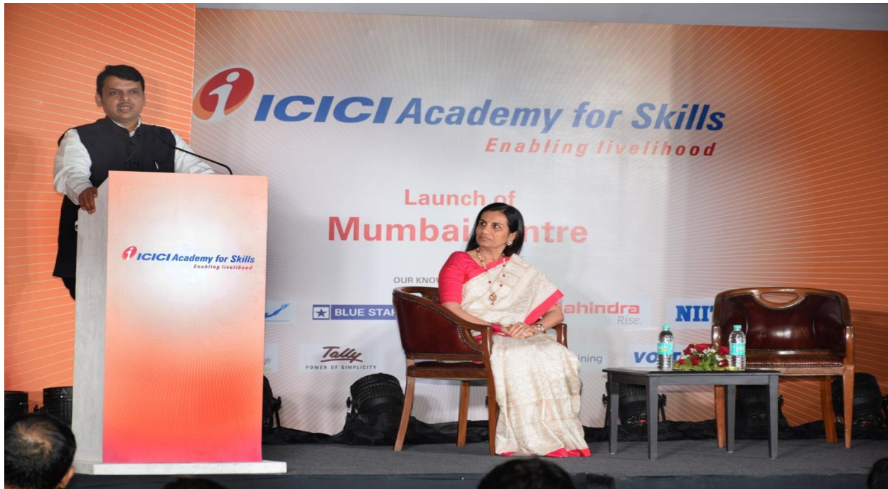
Shri Devendra Fadnavis, Hon'ble Chief Minister of Maharashtra addressing the audience