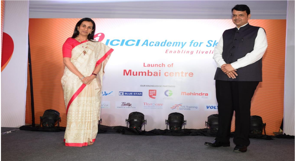
Shri Devendra Fadnavis, Hon'ble Chief Minister of Maharashtra and Mrs Chanda Kochhar, Managing Director & CEO, ICICI Bank Ltd. at the inauguration of ICICI Academy for Skills, Mumbai